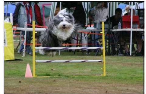
Air Claire in action