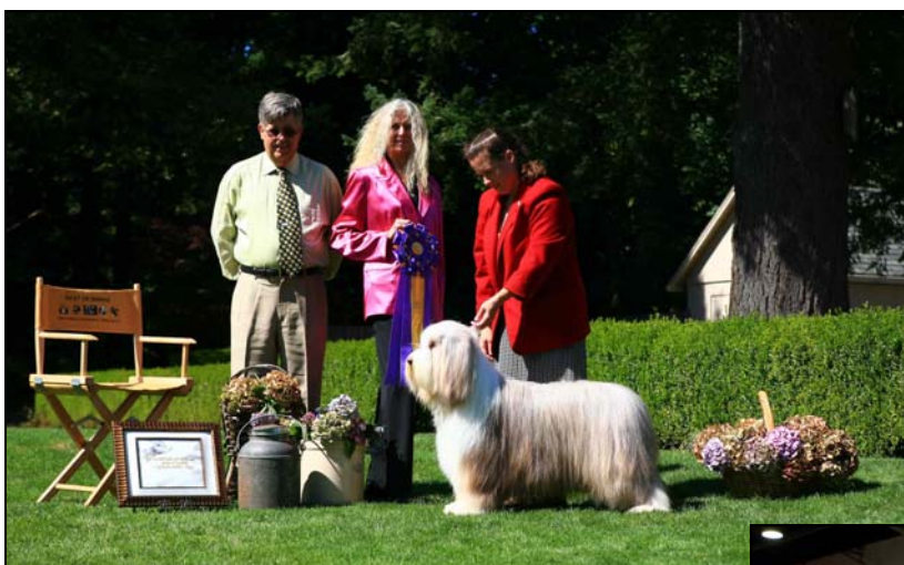
Brinian (Ch. Fivefields Reckless Abandon OA OAJ PT RN) took Best of Breed at the NWBCCPS Regional and Select at the National Specialties.