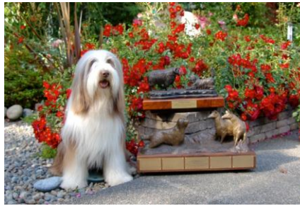
HC Pentangle's Touch the Skye

"Pleasure in the job puts perfection in the work." -Aristotle