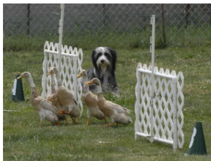
Chantilly Dusta OI Fashion Love Song (Jazz)

UKC-CD, AKC-RN, AKC HSad, Hlas, Bishop Award +, ASCA ATDDs, AHBA RD III, plus others and gulp AHBA Championship points. Have no idea where the year went or how we got there but indeed many many thanks to ALL involved.